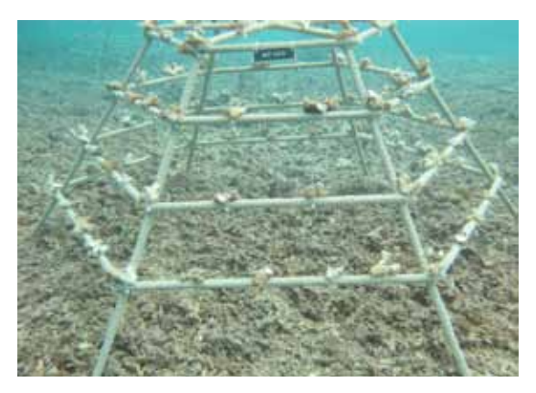
This frame was seeded in June 2011 (above). The same frame 20 months after deposition (below).