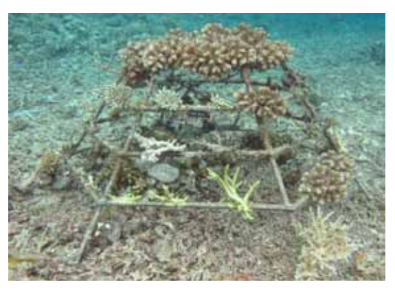
Frame No. 19 in September 2012, 15 months after deposition (above) and 31 months later (below).

Der Erfolg des Projekts wird durch die Tatsache unterstrichen, dass die Methodik bereits von der