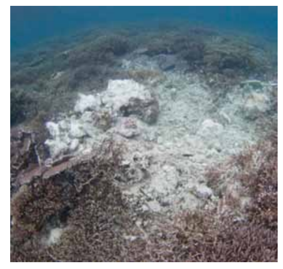
and branching corals. Reefs that have been reduced to rubble may never fully recover.

to be visiting mainly to feed and were observed browsing on the surface of the bars or the attached organisms.