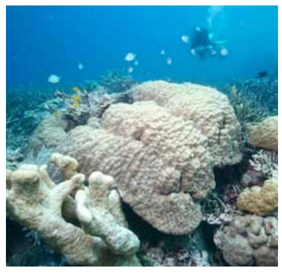
Intact and healthy reef with corals hundreds of years old. Recently-bombed reef showing destruction of both massive

foliose and small semi-massive corals but these have significantly slower growth and the foliose corals showed poor survival.