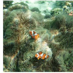
280,000 square kilometers beneath the ocean