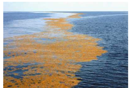
Free-floating Sargassum offers protection and habitat for many species.

Alterations to the shape of the coast, particularly the creation of artificial 'rocks' such as harbour moles or structural foundations, can bring about local increases in algae species diversity by creating additional habitat area along sandy coasts. On the other hand, marine pollution, particularly of sheltered bays, mangrove forests and coral reefs, has caused a decline in species and promoted more resilient species to the detriment of others.