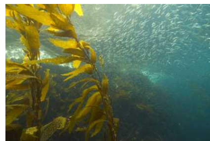
The kelps' holdfast organs serve only for anchorage to the substrate, and unlike terrestrial plant roots, they play no part in