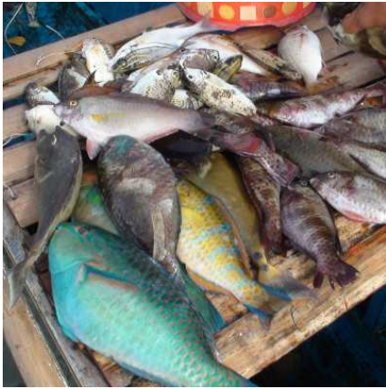
Project: Slow Food Campaign - Understanding the Oceans