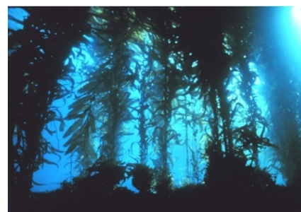
Brown algae like the giant bladder kelp ( Macrocystis pyrifera ) can reach the colossal length of 100 metres. The long fronds grow by up to 60 centimetres a day.