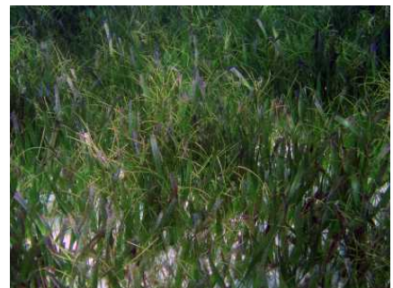
Light sea grass meadows in the shallow waters of the Florida Keys.