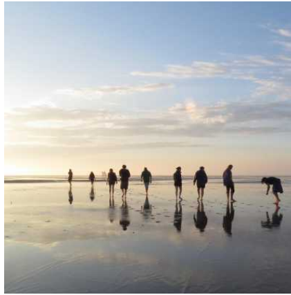
Project: Beachexplorer - what you can find on the beach