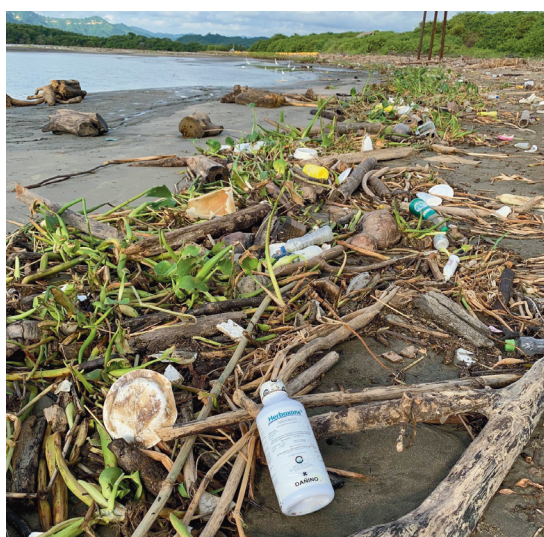
The herbicide bottle found under the washed up plastic waste in a coastal wetland illuminates the manifold threats to the sensitive ecosystems along the coast.

and fragile ecosystems by conducting research and conservation activities. By creating alliances with the public and private sectors to work together on awareness campaigns, the project includes media campaigns, the organisation of special festivals and the painting of murals dedicated to coastal birds and coastal wetlands. The aim is to raise awareness, increase appreciation of these ecosystems and inspire pride in coastal wetlands and their birdlife among the local population in order to gain support for the Eten wet-